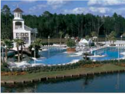
The Eagle Harbor Swim Club complex in Jacksonville, FL.