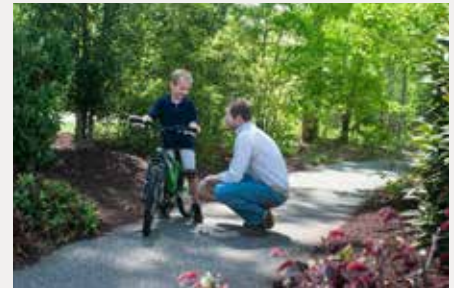
Pool, clubhouse, playground, trails, and more coming in 2014 (see inside for amenity sitemap).