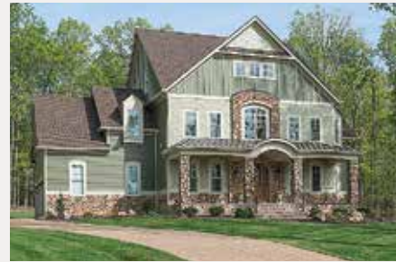
Creative Home Concepts 897-1639 Sales – The Beran Group; 794-9650 Long & Foster Realtors